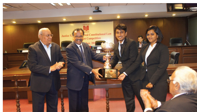
'Justice Y. K. Sabharwal Constitutional Law Moot'