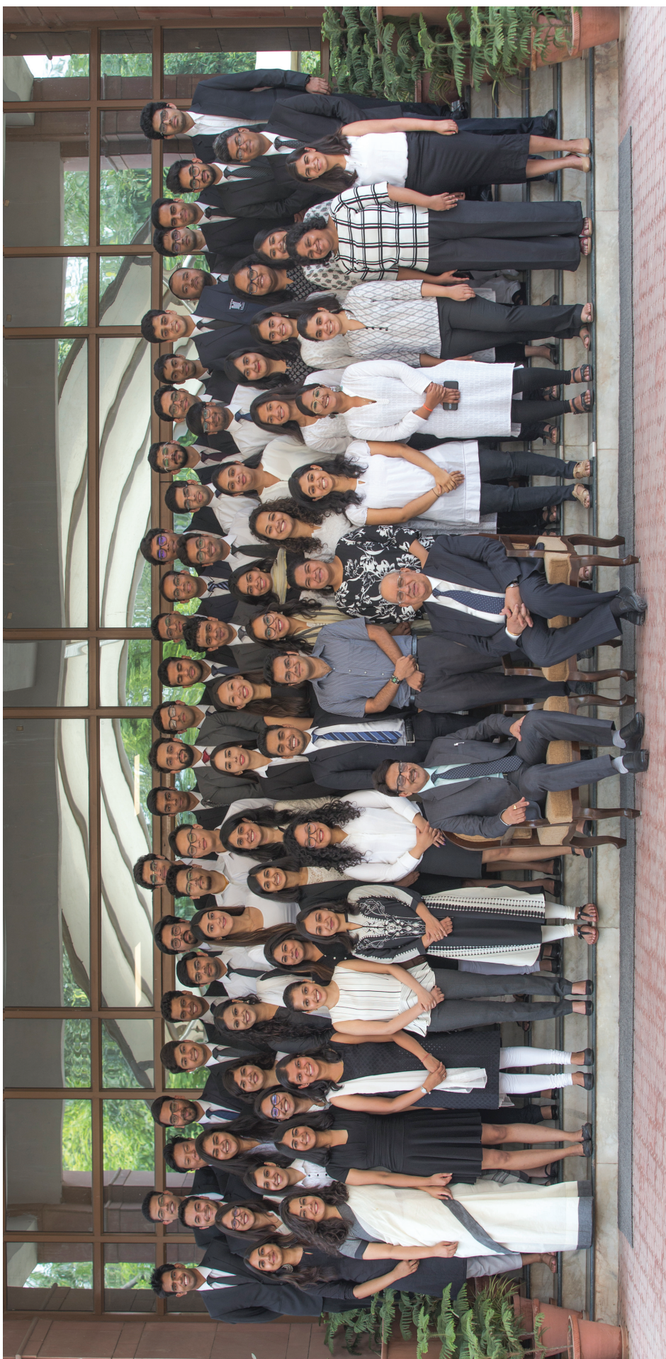
B.A.L.L.B. (Hons.) Batch of 2018