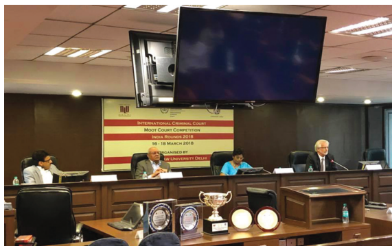
India National Rounds of the 'International Criminal Court Moot Court Competition'